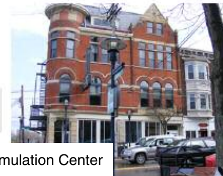
This is the view facing Vine Street