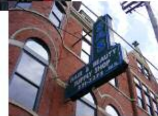
We have a Beauty Shop Sign out front!

UC Simulation Center 2728 Vine Street Cincinnati, OH 45289